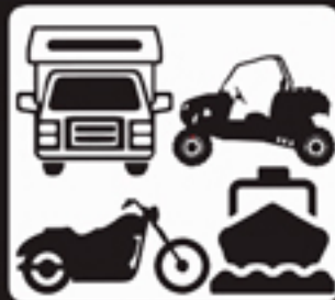
Table Rock Fiberglass Repair